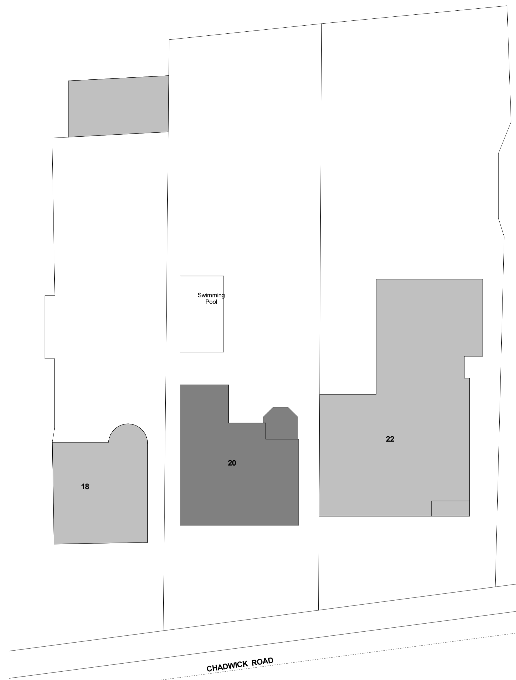
Site Plan Existing