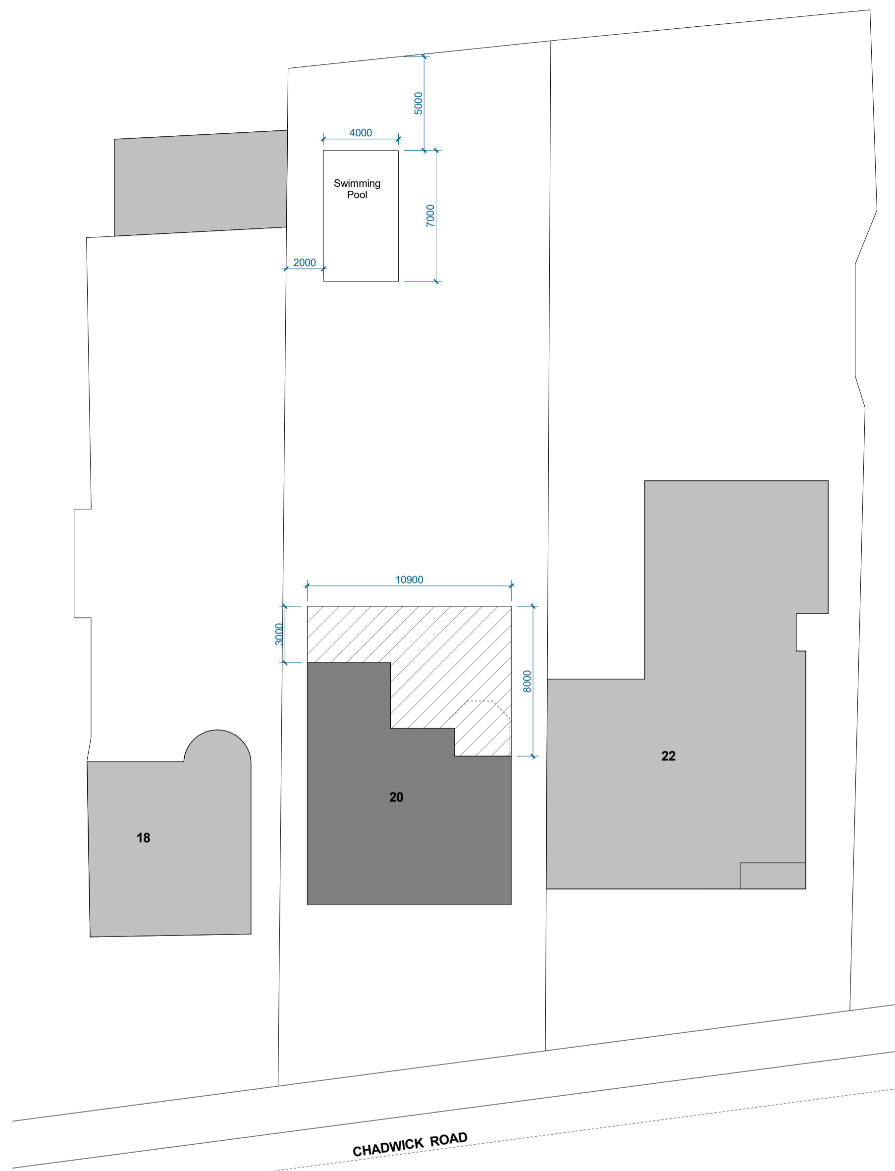
Site Plan Proposed

DRAWN BY: Author SCALE: As indicated DATE: September 2016